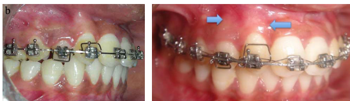
[Table/Fig-2b]: Spec torquing auxillary in-situ. [Table/Fig-3]: Corrected root position of transposed teeth.